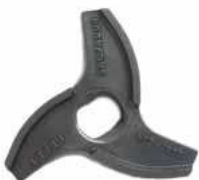
Coltello inox unger S/steel Unger knife Couteau inox unger Cuchilla Inox Unger