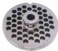
Piastra inox S/steel plate Filière inox Placa en acero inox