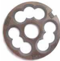
Piastra Inox Sgrossatrice Tipo "0" per coltello circolare S/steel coarse plate "0" for round knife Filière inox pre-coupe type "O" pour couteau circulaire Placas Inox para desbaste para cuchilla circular