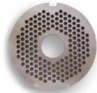
Piastra unger Unger plate Filière unger Placa unger