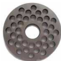
Piastra unger Zico no inox Zico Unger plates (not s/steel) Filières unger Zico non inox Placas unger Zico no acero inox