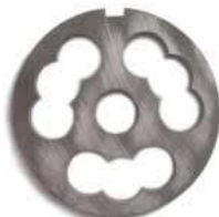
Piastra Inox Sgrossatrice Tipo "0" S/steel coarse plate "0" Filière inox pre-coupe type "0" Placas Inox para desbaste