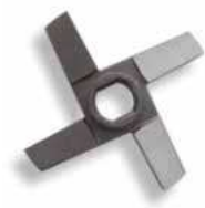
Coltello unger Zico no inox Zico unger knife (not s/steel) Couteau unger Zico no inox Cuchilla unger Zico no acero inox