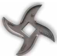
Coltello inox S/steel knife Couteau inox Cuchilla en acero inox