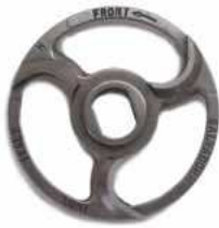
Coltello circolare inox unger Round s/steel Unger knife Couteau circulaire inox unger Cuchilla circular Inox Unger