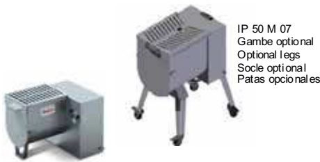
IP 50 M 07 Gambe optional Optional legs Socle optional Patas opcionales