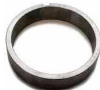
Anello distanziale Spacer ring Bague compensation Anillo distanciadore